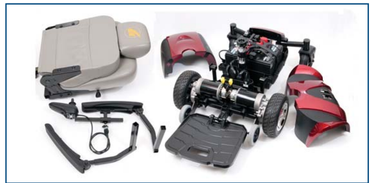
Disassembles easily into 6 pieces!

Literature is current at time of printing. Golden Technologies reserves the right to make changes to the product or literature at any time.