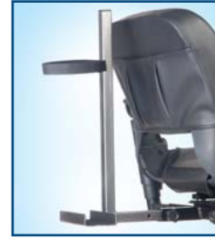
Quad Cane Holder